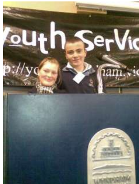
Warringa Park students presenting at the Forum.

'There were lots of people, I was a little bit nervous - but it was pretty good. We talked about the libraries in the City of Wyndham and how to involve young people in using them.'